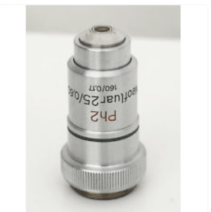
Zeiss Ph2 Neofluar 25/0.60 160/0.17 25x Phase Contrast Microscope Objective