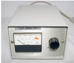
Zeiss #910224 Heavy Duty Microscope Power Supply for 100W illuminators.