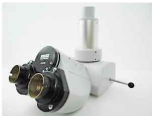
Carl Zeiss Microscope Trinocular Observation Head Excellent !

Fortunately for the purposes of this build, one was sold at a very reasonable price during this time period by a responsible and reputable seller. A pair of 12.5x eyepieces complements this head nicely.