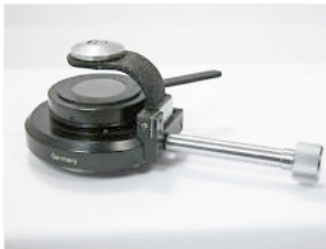
ZEISS 1.3 FLIP-TOP CONDENSER Nice!

The third condenser, a Phako IV'Z7 Aplanic 0.63 NA has brightfield (the default illumination of all these condensers) but lacks phase 1 and the extra darkfield stop. It has phase 2 and 3 and of course adds DIC. Phase 1 basically allows the use of the 10x objective, but as phase 2 starts at 16x, the lack of ph1 is not overly critical.