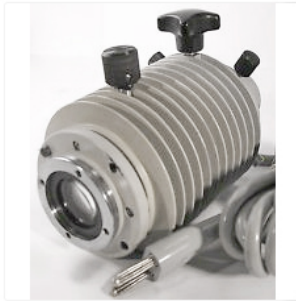
Carl Zeiss 12V 60W Illuminator for WL, Standard, IM/ICM and Universal Microscope

To complete the illumination we need a lamp house and a power supply.