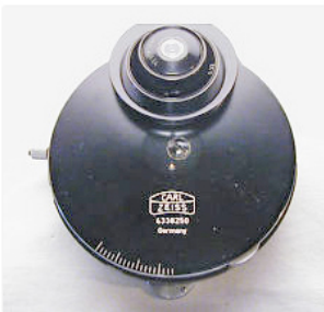
Zeiss Microscope Phase-Contrast Turret Condenser, exc. condition.