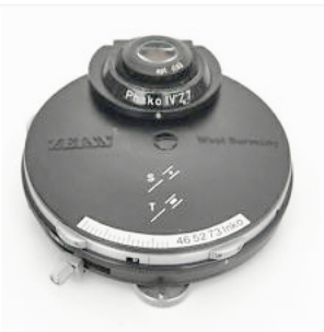
Zeiss Microscope 465273 Inko Phase Turret Condenser w/ apl 0.63 Top Lens