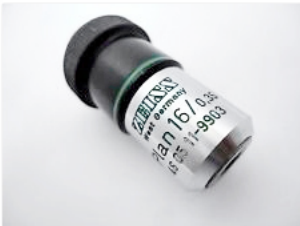
Zeiss Microscope Objective Ph2 Planachromat 16x Excellent !