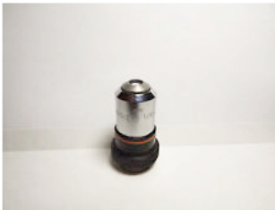
Zeiss Plan 6.3/0.16 rms Thread 6.3X Microscope Objective Lens 160mm

That just leaves the objectives. In this case the best plan (as our aim is to get up and running) is to go with phase, as phase objectives work well in brightfield and hence oblique and darkfield, as the slight theoretical image loss is in practice barely perceptible.