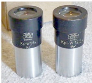
Carl Zeiss Eyepiece Pair- Kpl-W (Widefield) 12.5x